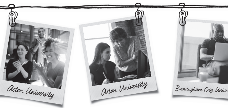
Talent Bank Tailored matching service to re-engage students in the process

PARTNERS WILL SCALE UP EXISTING PROVEN EMPLOYABILITY ACTIVITIES IN THEIR OWN INSTITUTIONS TO ENGAGE TARGET GROUPS