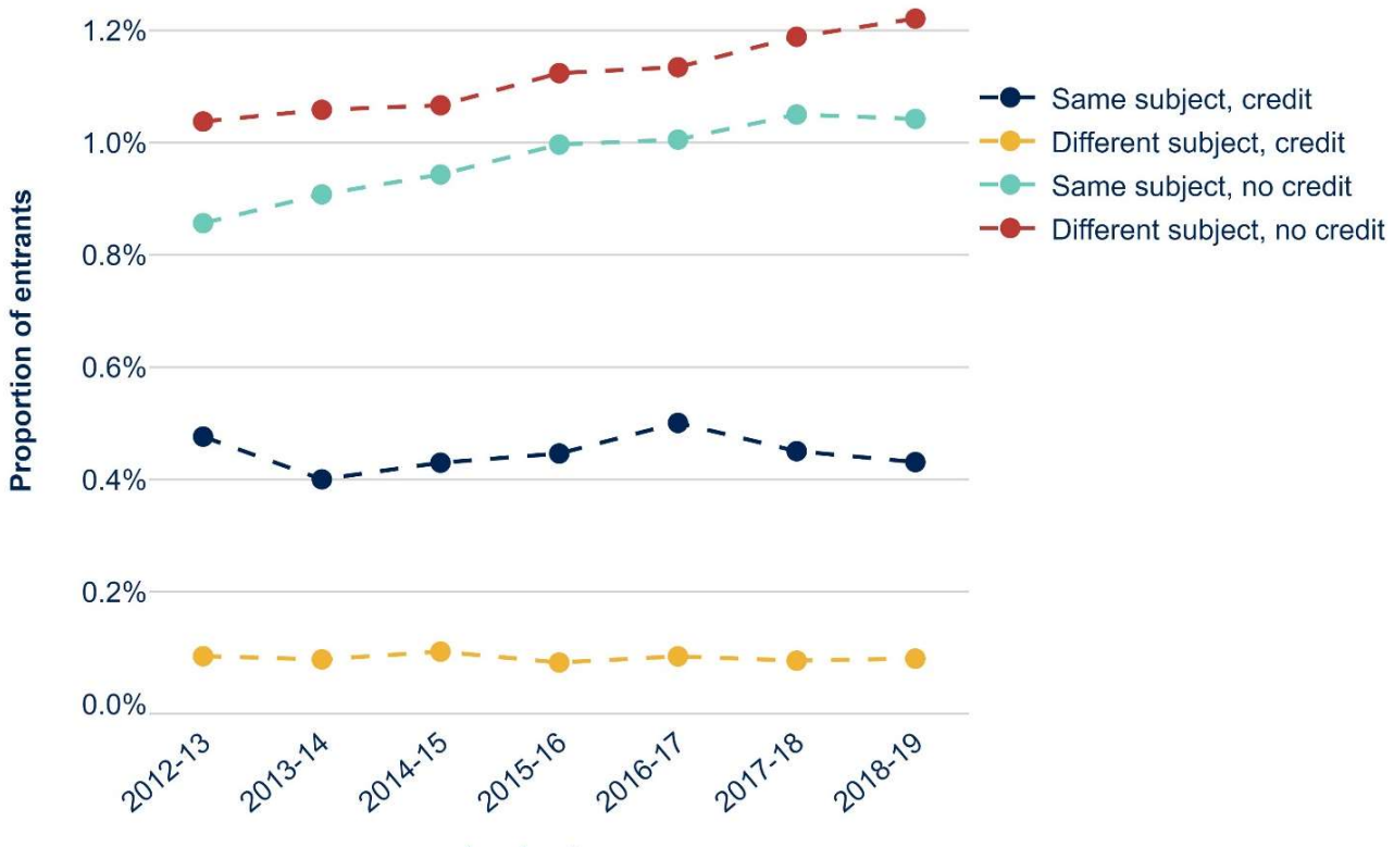
Figure 2: Proportion of first degree students studying at a <u>different</u> provider from 2012-13 to 2018-19